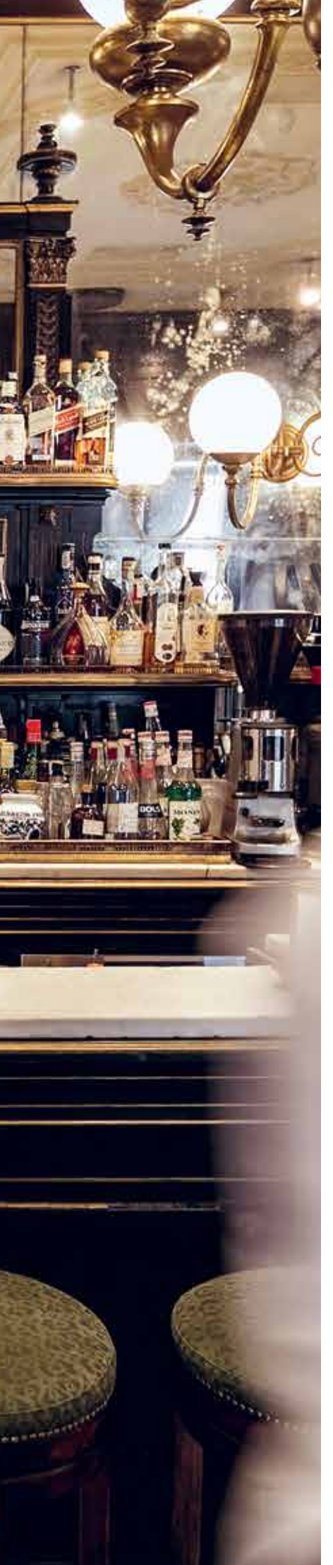
The convivial, fully stocked bar at Giacomo Bistrot

sauce. For a dressed-down evening, KANPAI (kanpaimilano.it) in Porta Venezia exudes an underground vibe and izakaya-style tapas paired with Japanese beer and whiskies, while GIACOMO BISTROT (giacomobistrot.com) takes cues from a French bistro