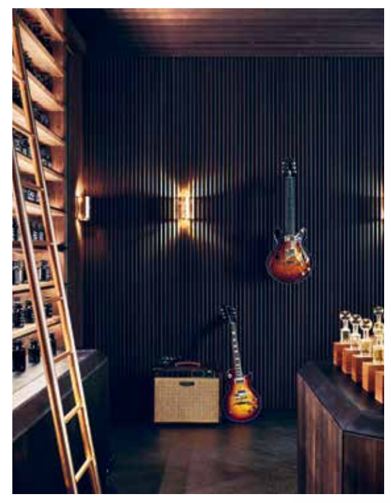
Argentinian perfume maker Fueguia 1833